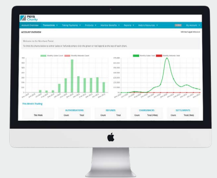
Track the performance of your donation boxes in real-time, adapting your campaign strategy to achieve optimal results.

Your transactions are viewable in graph and table form, giving you a quick visual summary of your transaction worth each month.