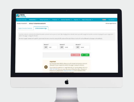
Manage contactless box settings online. View transactions, order products, reconcile statements and more.

Benefit from higher Volume, Higher Value Donations Today!